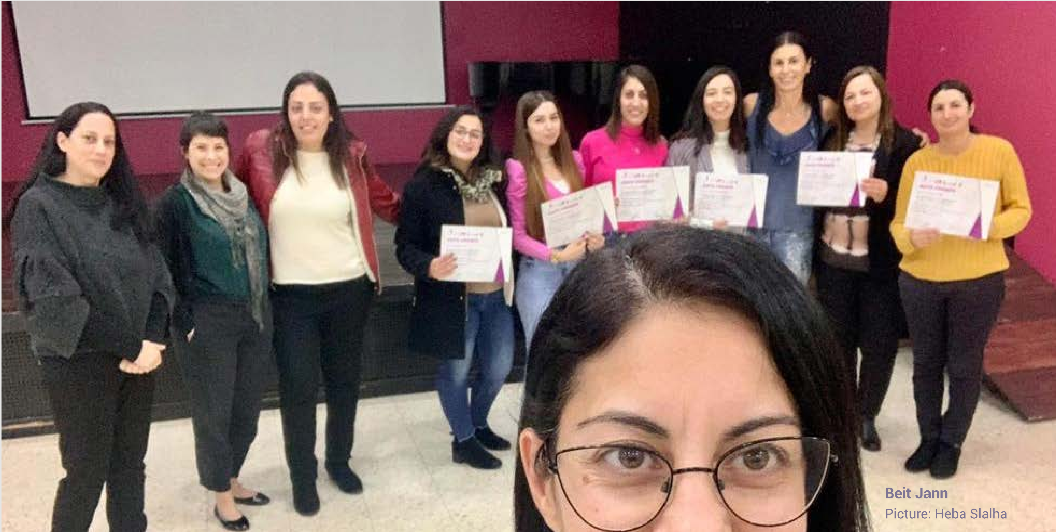
Beit Jann