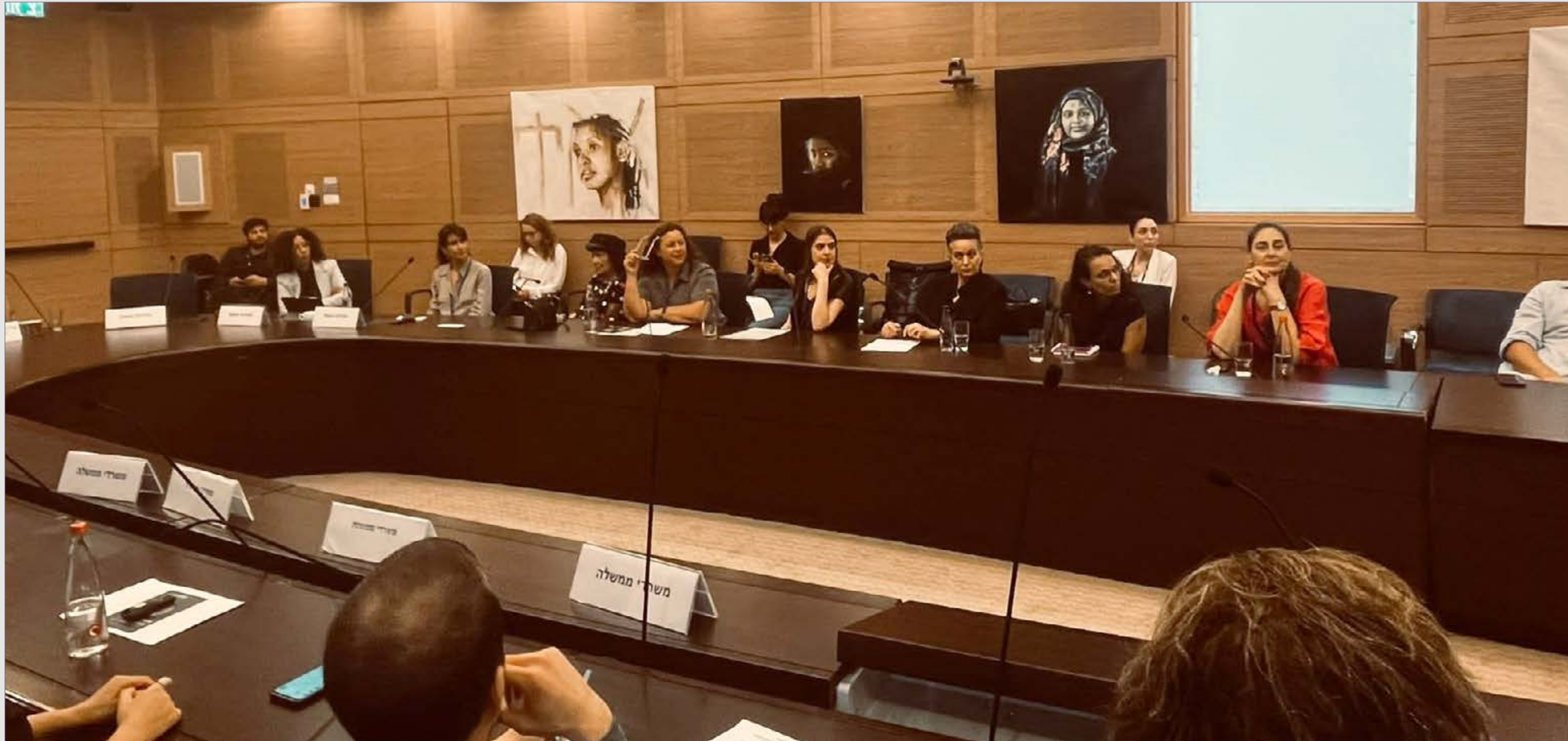
Knesset Committee discussion of "Celluloid Ceiling" report