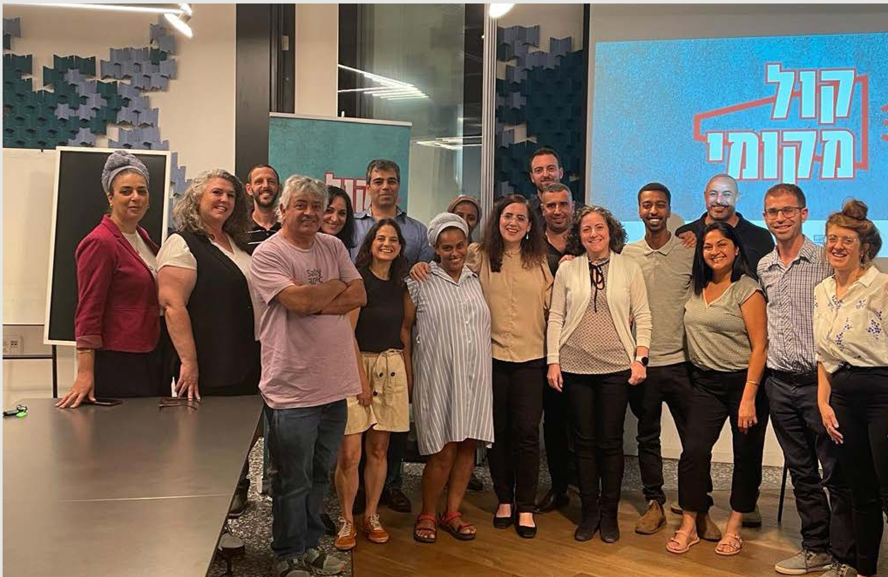
Course for municipal officials