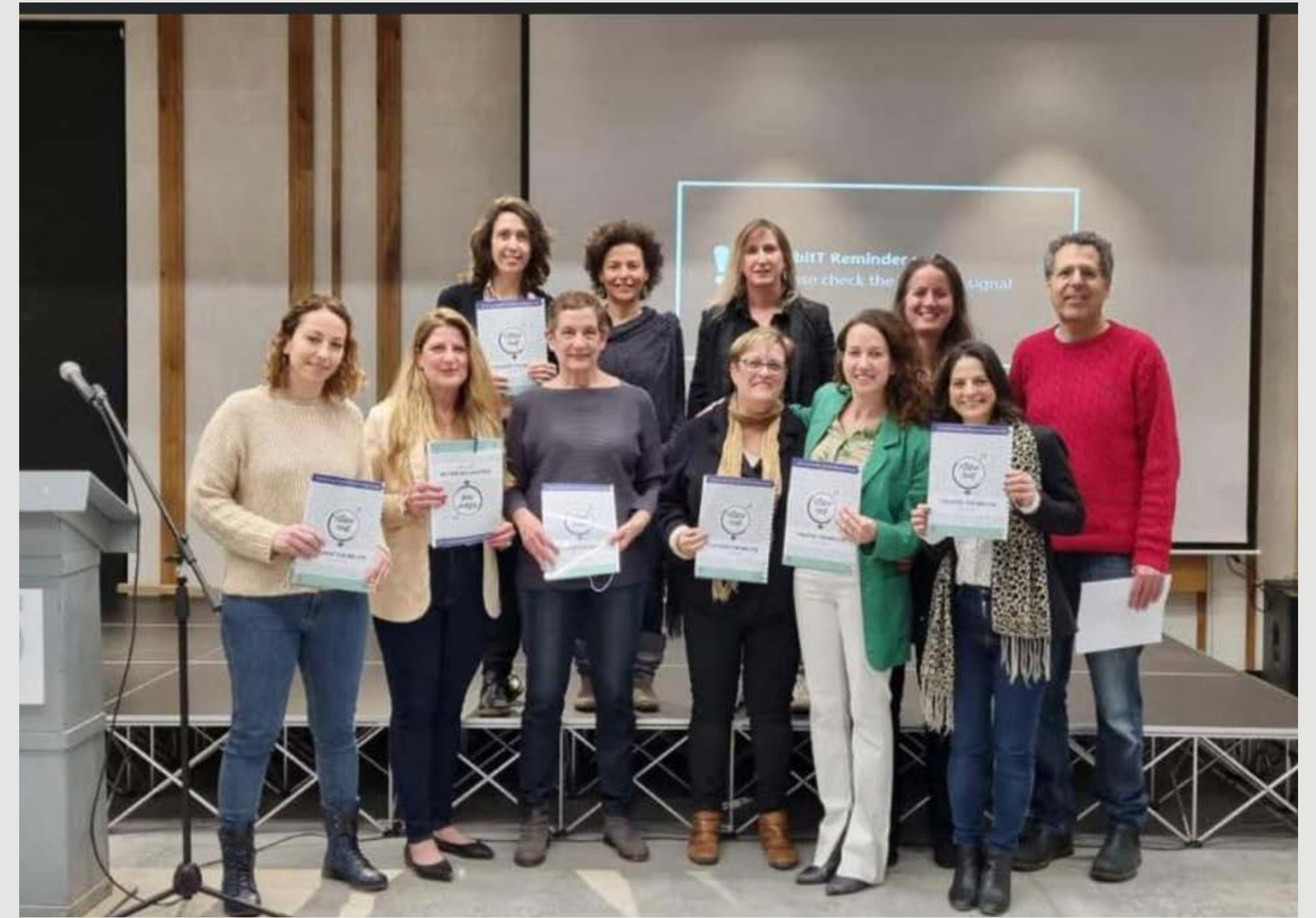
Launch of "Gender Equal Municipality" following the completion of a gender mainstreaming course and process in Emek Yizrael Regional Council